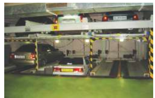
Pit Puzzle • RKSS - Pt 3000