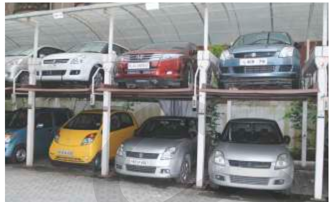
Twin Park • RKSS - 1500